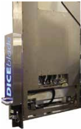
DICEbase Monochrome in maintenance position

The DICEbase Monochrome printer is an excellent way to add one-color digital print capabilities. Leveraging the state-of-the-art DICEblade technology this compact digital printer is the perfect size to fit in-line with production lines, converting lines, and existing printing presses. Whether your process is web based or on a conveyor, the DICEbase Monochrome printer's design can work for you. It allows you to add variable data and other information to your products, labels and packaging. The DICEbase Monochrome printer works on almost any substrate.