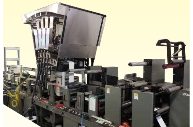
DICE™ inkjet printer retrofit on to a flexo press