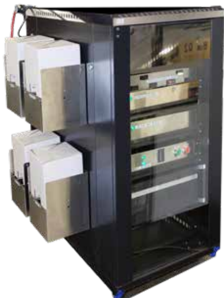
Control Cabinet with bulk ink supplies