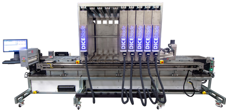
DICElab populated with 6 DICEblade modules