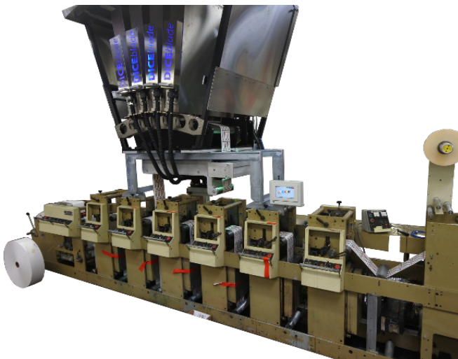
DICEweb on a Mark Andy press