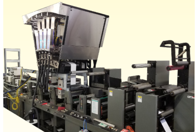
DICEweb retrofit on to a flexo press