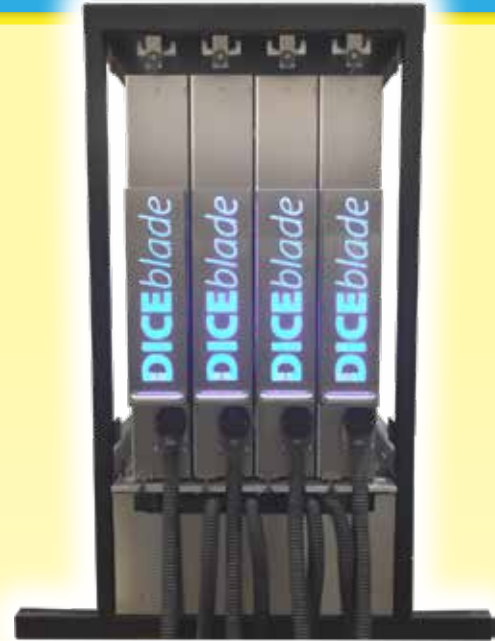
DICEbase- (4 colors)

DICEbase is configurable in length. The DICEbase frame can be built to include extra spaces for print modules that can be populated at a later date with new blades adding new colors, coatings or other custom formulations for jetting. Additionally, each print module's print bar can be built with extra space for print heads that can be added later creating more print width.