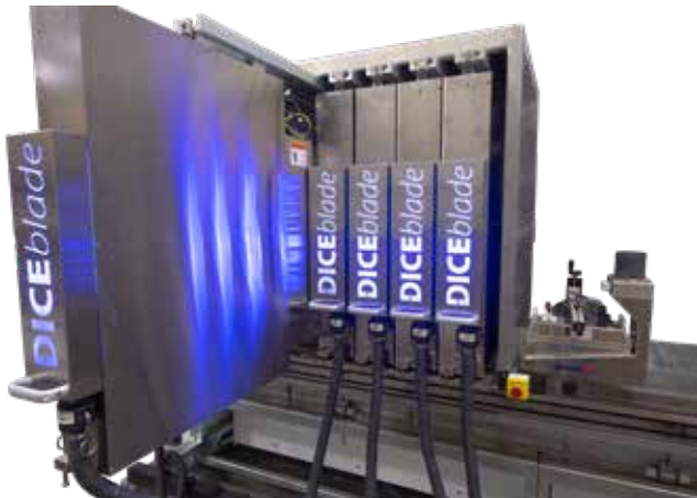
5 Color DICEbase in maintenance position