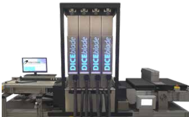
4 Color DICEbase Over a Conveyor